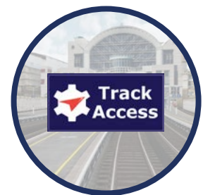
Acquisition of Track Access & rail software portal