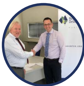
RDA Hunter – new Australian strategic partnership