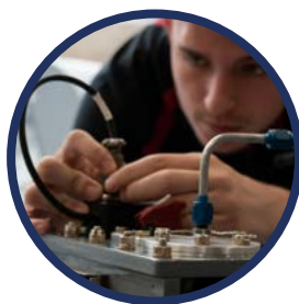
Launch of new Generic Fastener Installation Trainer (GFIT)