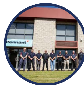
Continued investment in infrastructure